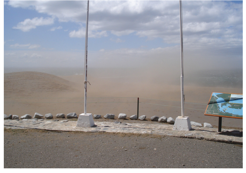
Fig. 2. Photo showing dust storms provoked by loss of vegetation after drought of 2009.

These areas are no longer very suitable for building new burrows because the burrows collapse too easily. These three plots have registered the highest population decreases on the island. Plots 1 and 5 are linked by the large valley located between the lighthouse and the jetty, while Plot 4 is located