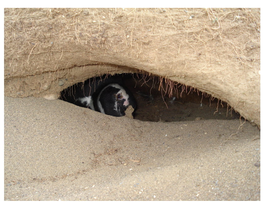
Fig. 3. Photo showing penguin burrows being buried by loose soil during dust storms.

on the opposite side of the island where tourists never visit. The plots were chosen to observe differences caused by the presence and absence of tourism in these types of flat terrain.